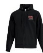
UNISEX FRONT AND BACK LOGO FLEECE FULL ZIP HOODED SWEATSHIRT - PRINTED $51.00