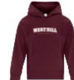
YOUTH FLEECE HOODED SWEATSHIRT - PRINTED $38.00