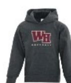
YOUTH COTTON VARSITY TWILL PATCH HOODIE - EMBROIDERED $52.00