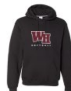
ADULT RUSSELL VARSITY TWILL PATCH HOODIE - EMBROIDERED $62.00