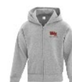
YOUTH FRONT AND BACK LOGO FLEECE FULL ZIP HOODED SWEATSHIRT - PRINTED $47.00