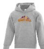
YOUTH FLEECE HOODED SWEATSHIRT - PRINTED $38.00