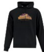
UNISEX FLEECE HOODED SWEATSHIRT - PRINTED $38.00