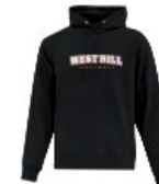
UNISEX FLEECE HOODED SWEATSHIRT - PRINTED $38.00