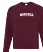
ADULT FLEECE CREWNECK SWEATSHIRT - PRINTED $30.00