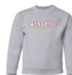
YOUTH CREWNECK SWEATSHIRT - PRINTED $30.00